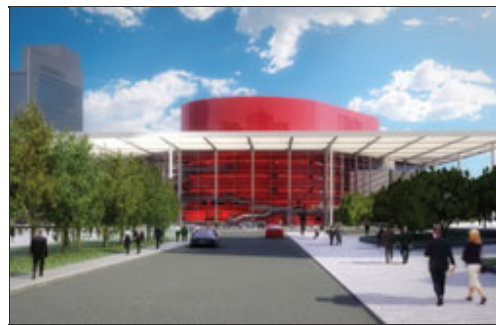
When completed, the performance space will be clad in vibrant red glass, earning the nickname "The Red Drum." A massive solar portico radiates from the building.