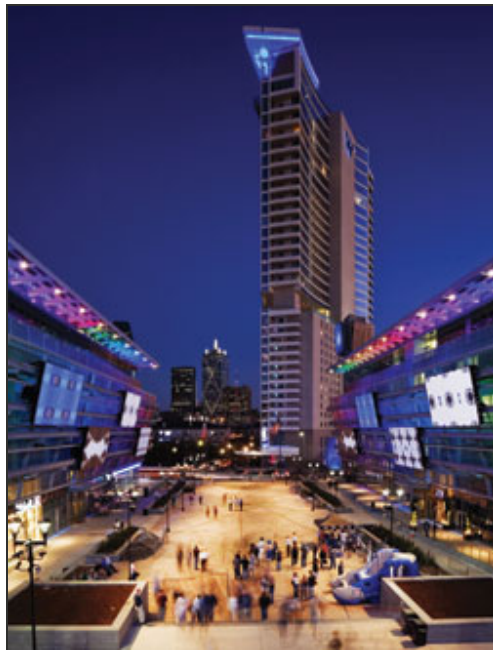
Victory Plaza and W Dallas Victory Hotel & Residences.

The brainchild of Dallas-based Hillwood, a company owned by Ross Perot Jr., the 75-acre site could be home to more than 4,000 residences and 4 million sq ft of office and retail space at build-out. Hillwood established its footprint in Dallas with the completion of American Airlines Center in July 2001.