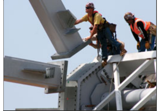
Crews led by Manhattan Construction place the first section of a roof span at the Dallas Cowboys Stadium project. The dual 1,224.5-ft-long arches will make the 661,000-sq-ft domed roof the longest clear-span structure in the world.

The 135-acre site is familiar ground for HKS and Manhattan Construction. In 1994 the team completed work on the neighboring Ballpark in Arlington, home of the Texas Rangers Major League Baseball team.