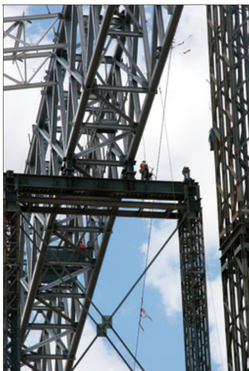
Crews erect one of the massive arches that will support the roof of the new Dallas Cowboys Stadium.

These days, it's true that everything is bigger in Texas, especially in and around Dallas. Contractors are busily filling out the Big D's skyline with an unprecedented lineup of new towers and megaprojects.