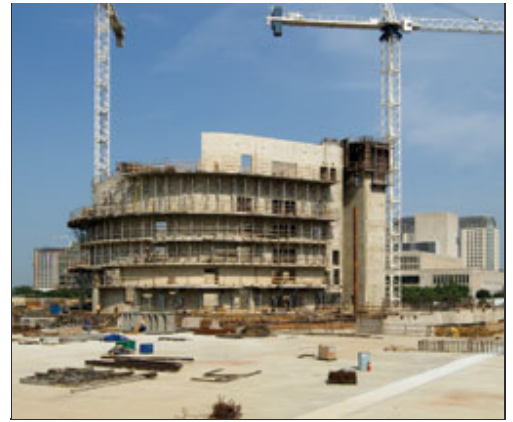
Linbeck is building the 2,200-seat Margot and Bill Winspear Opera House as part of the $275-million Dallas Center for the Performing Arts.

As work was being completed at the W, Victory Park developer Hillwood announced plans for 120-room The Mandarin Oriental Hotel and The Residences at Mandarin Oriental, which will include 90 luxury condos. The hotel is part of the 45-story Victory Tower, designed by Kohn Pedersen Fox, New York City. The Dallas office of Balfour Beatty Construction is currently in the preconstruction phase of the tower.