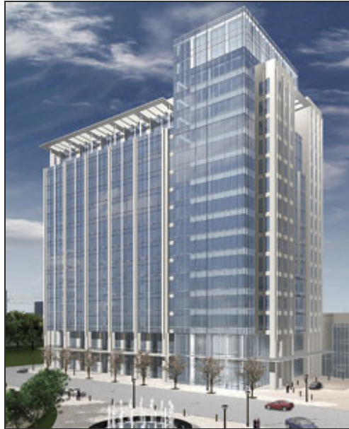
One Victory Park

The building, designed by Beck Architecture, Dallas, adds a dramatic look to the local skyline with its curved-glass curtain-wall façade that resembles a sail. The project broke ground in October 2005 with occupancy slated for this fall.