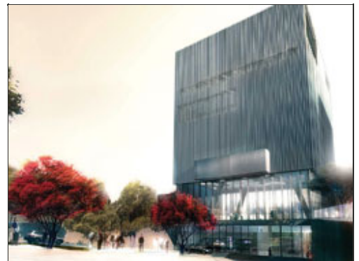
The innovative Wyly Theatre, being built by McCarthy Building, will feature a specially mechanized "superfly" system to pull up seating and scenery.

Turner's Latona says the site required significant soil remediation. Crews removed soils up to 27 in. deep, then reconditioned them before putting them back in place. The concrete structure will be clad a variety of exteriors, including large timbers and wood ceilings to give it a lodge feel.